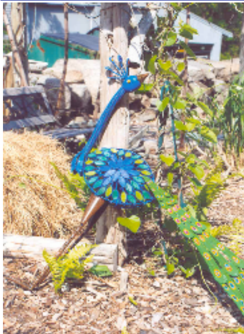
A colorful garden visitor at Long Hill Spire